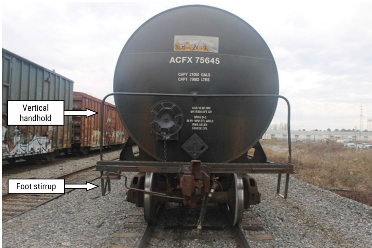
Figure 3. The end of the railcar where the conductor was riding.

The railcar that the conductor was riding was a DOT-111 tank car. The railcar was equipped with a foot stirrup and vertical handhold at each corner. (See figure 3.)